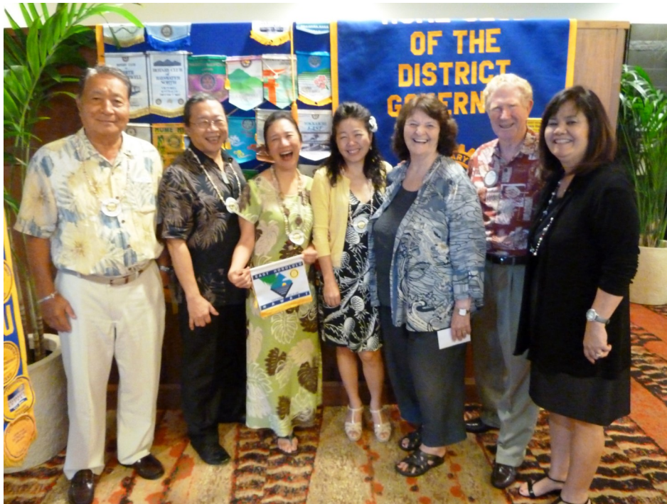
Taipei East Rotary Club Visitors