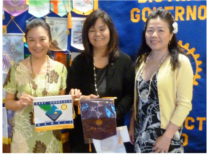
Taipei East Rotary Club Visitors